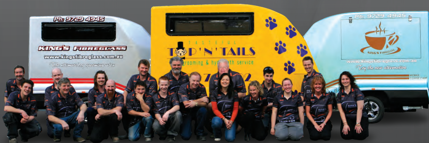
The team at King's Fibreglass celebrate the sale of their 200th trailer

We would like to take this opportunity to introduce King's Fibreglass Trailers, a division of King's Fibreglass Pty Ltd. We have been manufacturing quality Fibreglass Components for many years and have a broad customer base Australia wide. Recently, we have celebrated the sale of our 200th plus Dog Wash Trailer.